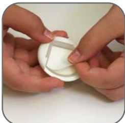
Remove Protective Liner