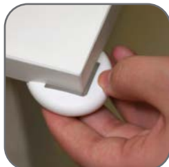
Attach Corner Protector by lining up the inner corner with table/ furniture corner.