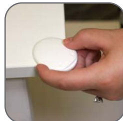
Press firmly for 30 seconds. Leave for 24 hours to set for maximum adhesion.